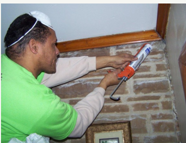
MISSION GREEN TRAINEE IMPROVING THE ENERGY EFFICIENCY OF A HOME ON FORT CAMPBELL.

The Green Economy holds a clear promise to build sustainable communities that are energy efficient, safe and healthy. This movement provides the opportunity to give Veterans career paths that offer them economic security to support themselves and their families. Green jobs will draw on many of the skills currently used in building and trade fields.