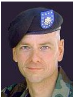
OKLAHOMA SENATOR LT. COL. STEVE RUSSELL, US ARMY RETIRED

The OSDN Board of Directors announced the 1st Annual Heroes Breakfast fund raiser. The purpose of the event is to honor Outstanding Veterans, our heroes.