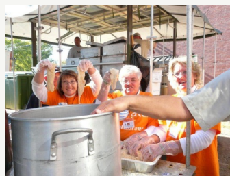
LADIES FROM ONE OF OUR VOLUNTEER GROUPS DEEP FRYING THE CATCH OF THE DAY DURING THE 2010 STAND DOWN EVENT.

volunteer, please call us at 615.248.1981 or email walkamile@osdnashville.org .