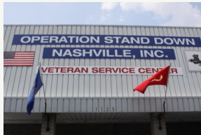
NEW SERVICE CENTER, MOVE IN DATE AUG 2009

As of August 2009, Operation Stand Down Nashville has a new home. While we didn't move far, it has brought about significant changes.