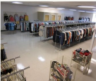
LAYOUT OF THE SPACIOUS NEW THRIFT STORE