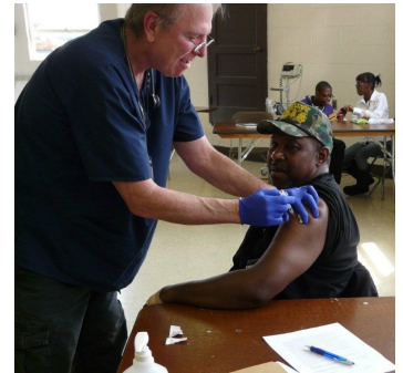
CLIENT RECEIVING MEDICAL ATTENTION FROM ON-SITE HOSPITAL PERSONNEL .

We need your help. Contact us at walkamile@osdnashville.org to see how you can be a part of this great mission.