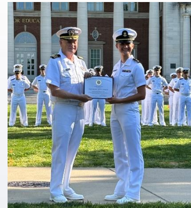
Navy/Marine Corps ROTC (Vanderbilt) 22 April 2024